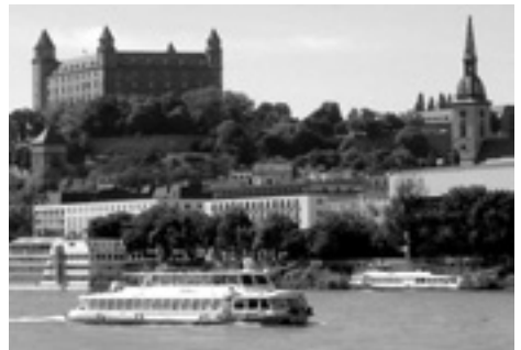
Bratislava Castle on the shores of the Danube River in Slovakia.