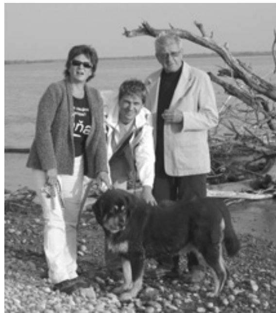
ABOVE By the Danube with Mom and Dad and our beloved Tibetan Mastiff Dasya.