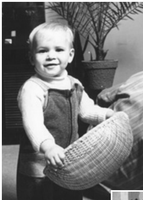
ABOVE The earliest picture I could find. I may be two or three.