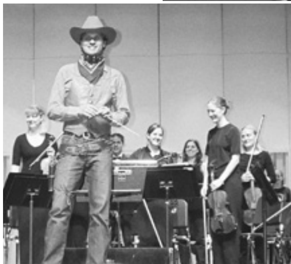
RIGHT For one of my first concerts in Arizona I dressed up as a cowboy to conduct Copland's "Billy the Kid."