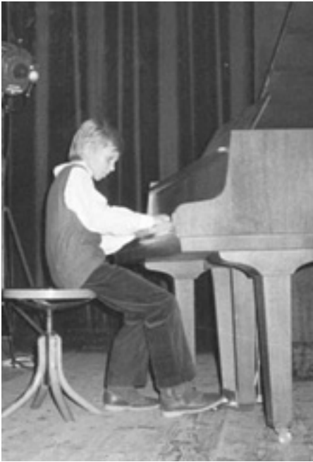
ABOVE The earliest picture of me playing piano. I am probably nine or ten here.

I began studying music when I was six years old. The main reason was that we had a piano at home. Back in the era of socialism, the education was free and quite excellent, one of few good things in the otherwise rotten system.