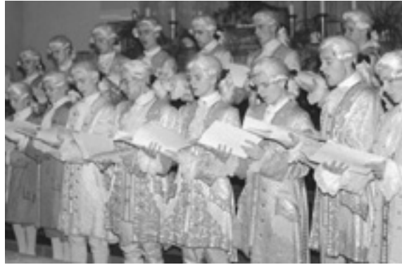
LEFT This is the Amadeus Choir from Bratislava. I am 16, fourth on the right, bottom row. We toured Belgium, Germany, and France singing Mozart and Christmas carols. I ended up singing with the Slovak Philharmonic Chorus and Munich Philharmonic under James Levine. [Later] I established my own choir specializing in early music.

I got an excellent teacher. . . . I was never forced to practice so I only played as much as I wanted. I certainly cannot claim a title of wunderkind but I have no regrets: I am grateful for having a normal childhood.