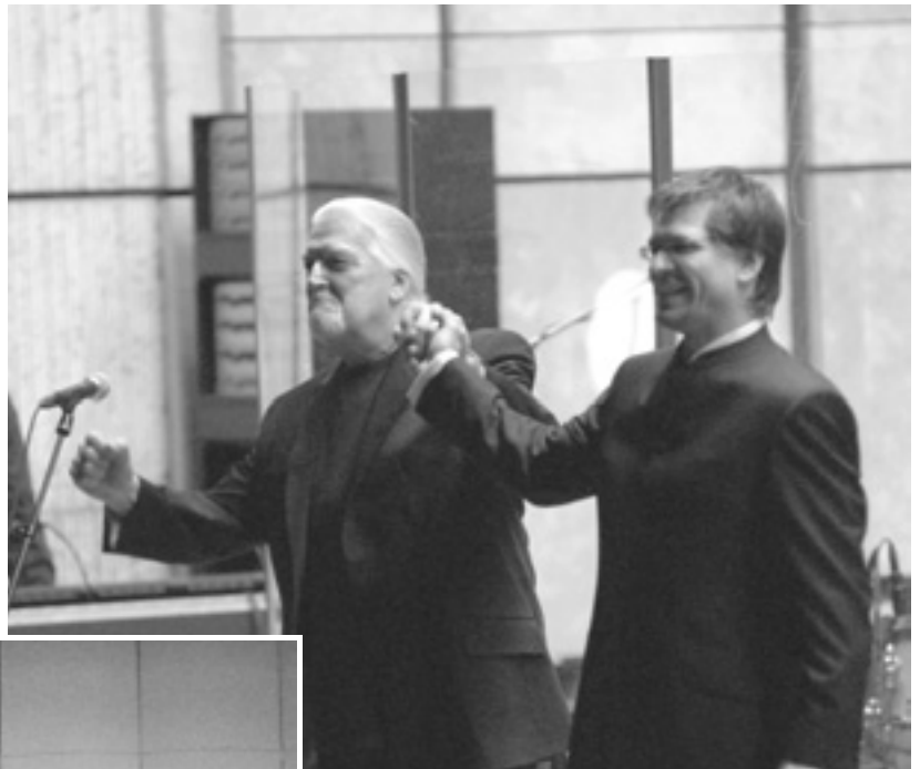
ABOVE From the concert with the Slovak Radio Symphony Orchestra featuring Jon Lord, the legendary keyboardist of [the rock group] Deep Purple.

"I never paid a dime for my education. In Slovakia, schools are free, including the universities. In the U.S., I had scholarships—first Fulbright, then a scholarship from the University that covered my tuition."